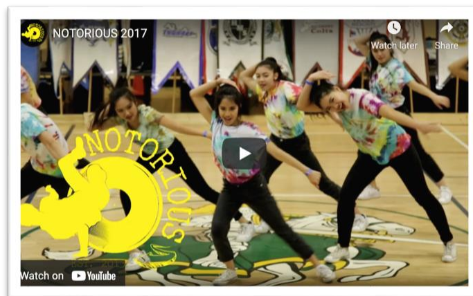
More of Notorious 2017.

Finally, the time came, they made the dancers line up. I was put in the middle, right in front of the bright lights. I looked out to the crowd, the bleachers were filled, due to my nerves, I looked away. I observed the other dancers up on the stage with me, they were all seniors; I was the only freshman. This made things ten times worse for my jittery hands and feet. That year, in particular, they decided to do something new. The music was a remix, and no one knew what song it was. I could tell it made the other dancers nervous too. We all were confused at the songs, no one could immediately identify them. It felt better knowing that others felt the same; at the same time, this meant that I wouldn't know the song, and I wouldn't be sure how to move. Two more dancers went, then another, it was getting closer to my turn. The MCs of the show counted down, "Five, four, three, two, one!" I jumped right into the deep end. I went up there, I could feel the adrenaline rushing through my body, and I was shocked at what I did. Throwing out moves left and right, I could hear the crowd cheering, I could see the judges were smiling. It felt like something new took over my body: self-confidence.