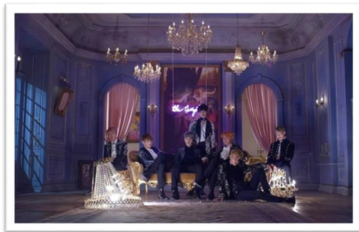
BTS: One of My Biggest Sources of Inspiration

K-pop helped me find my passion. When I was still in elementary school, I was drawn to many different activities, art, animation, games, filming, and more. Yet, those hobbies only lasted for a short time. It wasn't until I discovered K-pop, that I would realize that my passion was right in front of me this whole time. At home, I started to watch K-pop videos on YouTube; I was so astonished by all the visuals, dancing, as well as singing. After listening to mainstream American pop for the majority of my childhood, it was a new experience. One day I tried to learn one of the dances by my favourite group, BTS. After that, I couldn't stop. I found more songs that I enjoyed and learned those dances as well. It was one of the most joyful moments in my life—learning a dance, being able to remember each step, and performing it. I saw how confident the K-pop artists looked on stage, and it inspired me to grow more confident with my dancing—eventually, moving from the safety of my bedroom to a studio and a stage. Overall, my initial interactions with K-Pop is what helped me out of my comfort zone, and initiated my passion for dance.