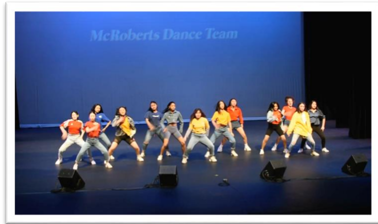
RichCity Idol 2019

they thought I was. Even after all this I still felt that I could do way better, and I was looking forward to the next competition. Four years ago, I wouldn't have ever thought about stepping beyond my four bedroom walls, or entering a competition in front of hundreds of people. Now, four years later, I am still a part of the dance team ever since then, and every year I've entered the freestyle competition, until finally this year I made all the way to the top three winners. The whole experience made more confident as a dancer, and a person.